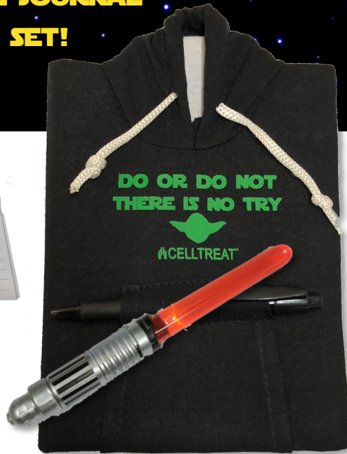
Notebook size is 7.5" X 5.25"